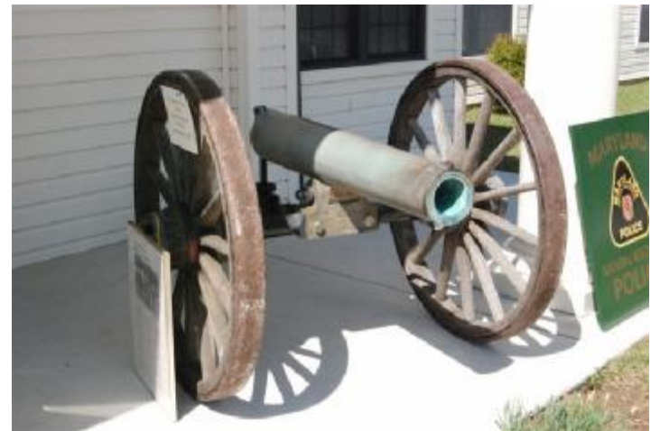
Cannon used by Maryland Oyster police during oyster wars of 1860's