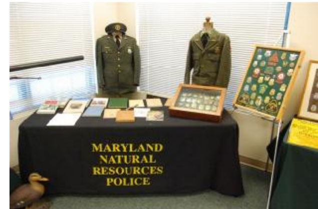
Uniforms, documents, and badges of the Maryland NRP