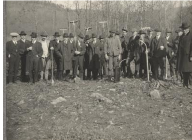
Forest wardens, circa 1920, with fire fighting tools

DNR's history is not disposable, either.