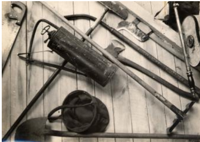
Fire fighting tools at Patapsco State Park, circa 1926