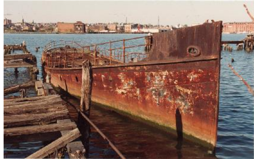
Governor McLane now